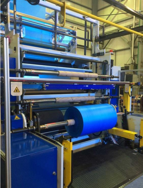
Production of HDPE film on the POLYREMA mono blown film line

Publication free of charge - Please send voucher copies to the attention of Otto Kuhl Words: 689, characters in main body of text: 3490